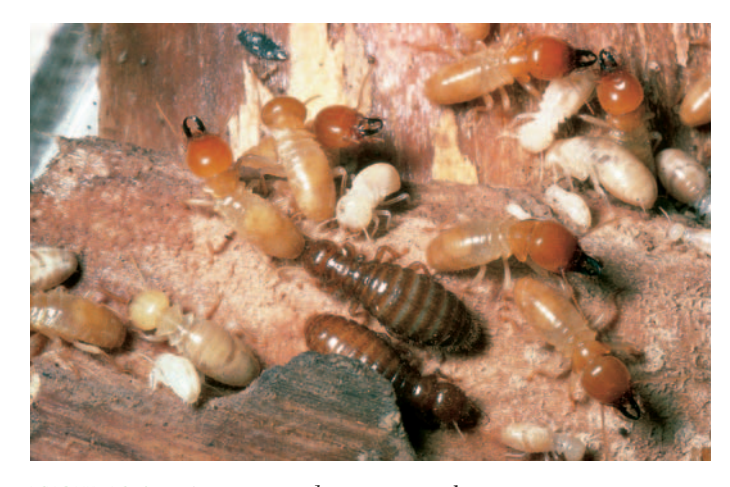
FIGURE 4 Mastotermes darwiniensis , the most primitive termite from Darwin, Australia. Tertiary-era fossils contain species from this family. Reproductive adults are in the center. Soldiers have large heads and mandibles. Smaller termites are workers.

This family contains the most primitive living termite, Mastotermes darwiniensis (Fig. 4), now limited to Northern Australia and Papua New Guinea. In appearance, these termites are light brown, robust, and about 8–10 mm in length. This family is recognized by the presence of an anal lobe in the hind wing of the reproductive adults and five-segmented tarsi. The hind wings are very similar to those of some cockroaches. Like cockroaches, reproductive