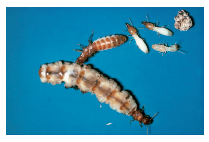
FIGURE 3 Castes of the Formosan subterranean termite, Coptotermes formosanus (Isoptera: Rhinotermitidae). In the center is a queen with large physogastric abdomen containing eggs. A king with a physogastric abdomen lies next to the queen. Soldiers have brown tear-shaped heads with sickle mandibles. A worker is also shown.

FIGURE 2 Life cycle of the termite. Lower termite family depicted. (Adapted, with permission from FMC Corp., from The Mallis Handbook of Pest Control , 1997.) Neotenics of one type or the other may differentiate if the primary reproductive(s) of either or both sexes are dead or senescing, or if the neotenics are in, or will move to, an isolated or distant portion of the "colony".