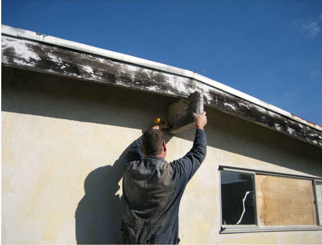
Figure 3. Example of drilling a board infested with drywood termites before Treatment; location Torrance, CA. Included in image is M. Red, Clark Pest Control.